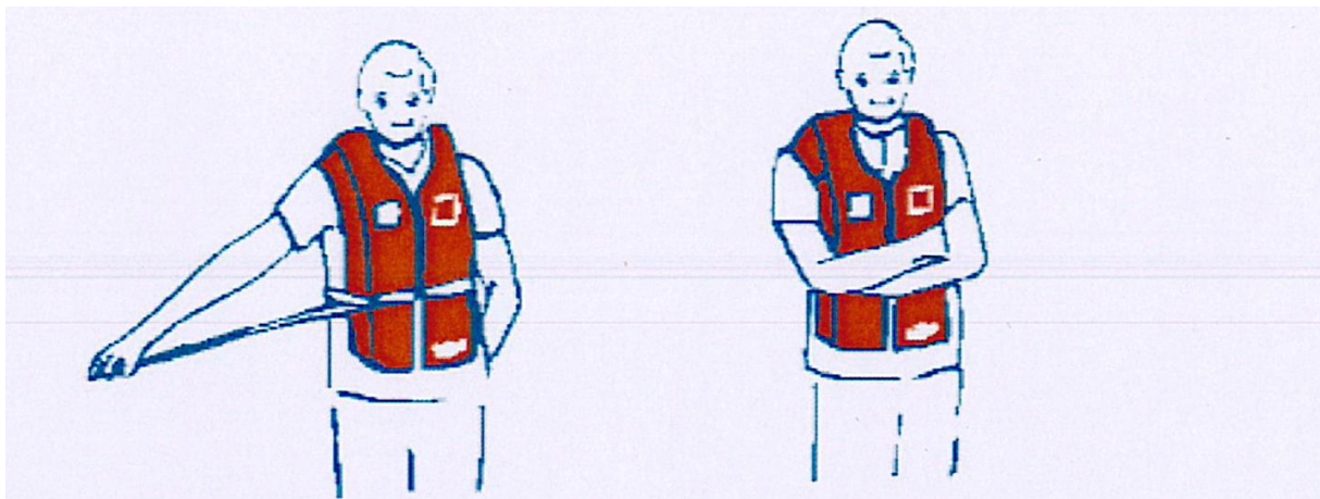
Adjust to a snug fit by pulling free end of strap